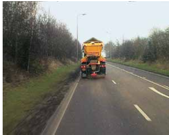
Thawrox stays where it's spread, reducing the amount of product needed to clear the roads.