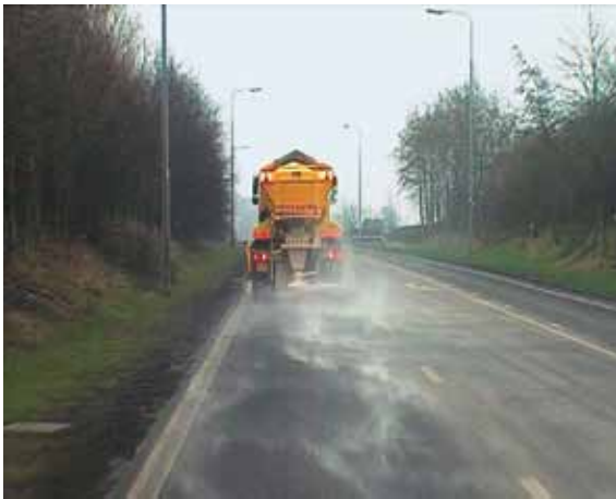
Traditional rock salt bounces around and flies off the road with wind and traffic movement.

Thanks to its efficiency and significant operational cost savings, Thawrox® is the future of deicing. Thawrox is produced by Compass Minerals, one of the largest basic producers of salt in the U.S. and an expert in the salt industry, so you can be sure you'll get exceptional customer service.